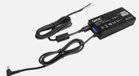
Bare Wire Version