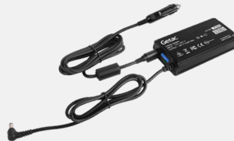
Cigarette Lighter Plug Version