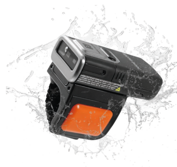
IP65 WATER/DUST RESISTANCE