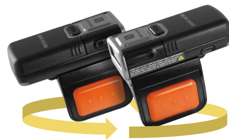
AMBIDEXTROUS RING TRIGGER

For the further inquiry, please contact: service@pointmobile.com